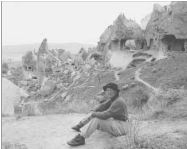
On the trail in Cappadocia (Adamek)

While it did not rain while we were there, the occasional dark clouds rendered the scenery even more spectacular. Cappadocia is indeed a photographer’s delight. (Time here for a note re films and airport security: always take film through by hand, no matter how safe the machines are said to be. On this trip we had one whole roll damaged which had been left in our suitcase by mistake.)