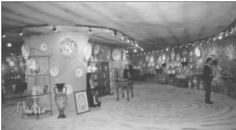
The magnificent store at the Kaya Ceramic Factory (Smith)