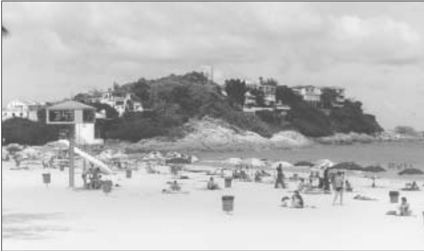
Shek O Beach on Hong Kong Island (Wallace)

As it was my daughter's first visit to Hong Kong, we hastened to fill our precious days with many first-visit highlights: the Star Ferry, of course (and at about 45¢ Cdn. a trip you can afford to do it often); the steep