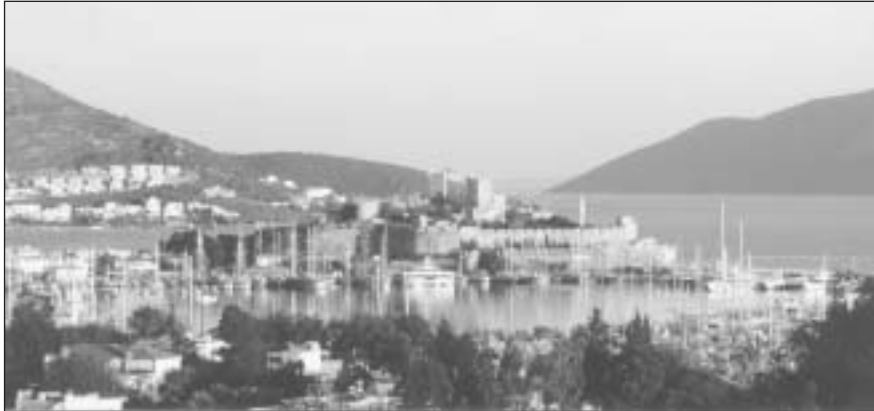
The Crusader Castle of St. Peter, Bodrum (Sampson)

This is about a 15-minute walk to the centre of Bodrum, past the Mausoleum, or you can take a dolmus from the entrance of the hotel. The hotel is small: 19 double rooms built in