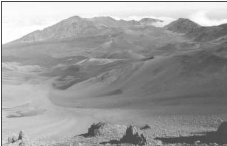
The Haleakala Volcano (Wallace)

Corinne recommended two Maui properties: the Silver Cloud Ranch in the heart of Upcountry, and Maluhia Hale (Peaceful Home) overlooking the north coast at Haiku. I found both properties to be just as Corinne described: the Ranch is set among rolling hills and guests look out over the gardens to the distant bay. There's a variety of rooms and cottage accommodation ... all very clean and acceptable, even if slightly on the shabby side. But there's nothing shabby about Maluhia Hale, where the rooms are bright and fresh with billowing drapes. When I called this property to introduce myself, owner Diane Garrett was so excited. "I'd love to meet you and show you around," she said, "and I also wish to thank you because we have a couple from Montreal staying in our cottage for a month, and they heard about us through TravelScoop !" This