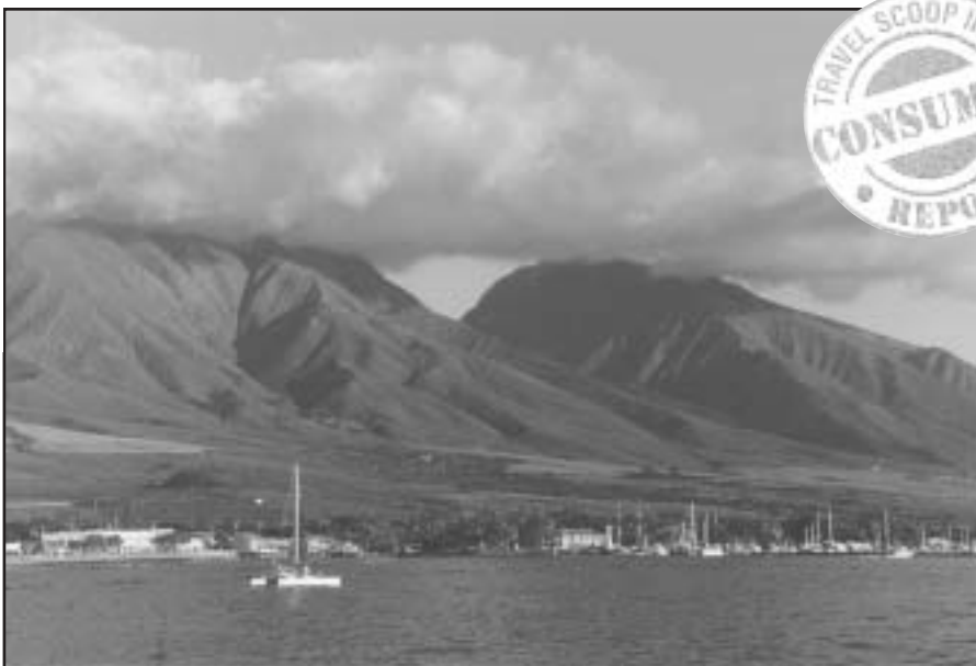
Lahaina was once the whaling capital of the world (Wallace)

From its spectacular coastline to the swirling mists of the lush area known as Upcountry to the moonscape of the vast, arid Haleakala volcanic crater, the Hawaiian island of Maui is breathtakingly beautiful. Here you can catch sight of fields of orchids and exotic proteas, discover beaches both deserted or alive with fluttering sailboards and daring surfers, taste fruits fresh from the farms and fish newly plucked from the sea, watch whales leap from the shimmering Pacific, meet some charming people, delve into a colourful history, and experience some of the world's most spectacular drives. With all it has to offer, it's no