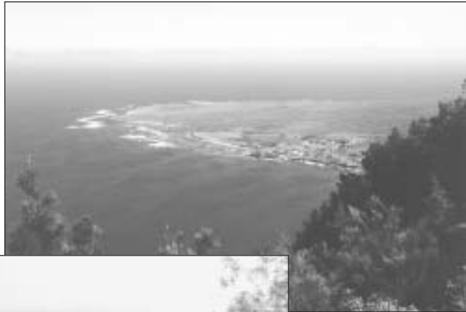
Kalaupapa from the Overlook

how hope was brought to it in the shape of courageous Father Damien, a Belgian priest, who decided to devote his life to fighting the government and helping the people of Kalaupapa. Living amongst the people, F a t h e r