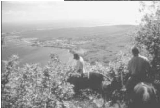
The Mule Ride to Kalaupapa

Damien’s efforts made the settlement more liveable by establishing a hospital, a church, meeting places and so on. He eventually contracted the disease himself and died in 1889 at the age of 49. It wasn’t until 1941 that sulfone drugs were found to arrest Hansen’s Disease and eventually the residents were free to leave if they