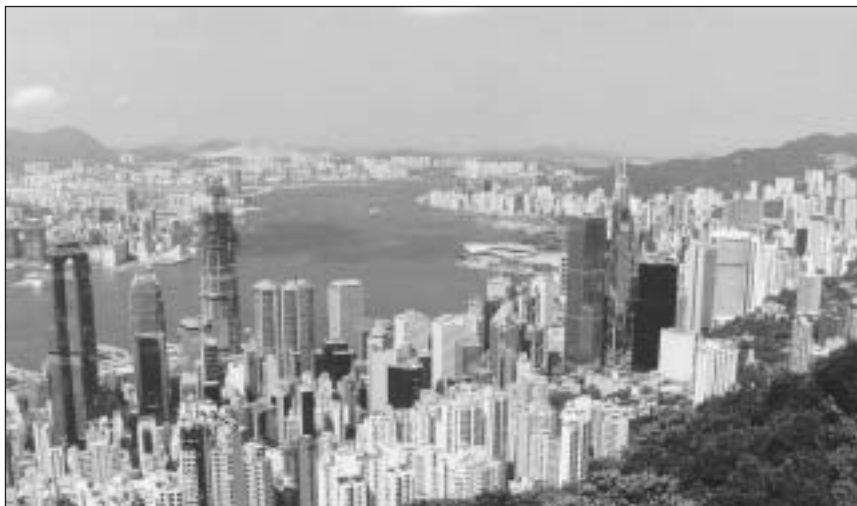
That famous - and ever-changing-view from The Peak (Wallace)

A couple of nights spent with friends in the New Territories, enabled us to splurge on our city nights and stay at the Shangri La Hotel. Overlooking that famous Hong Kong skyline from Kowloon (request a harbour view when making reservations) this hotel offers 5-star luxury but special rates are often offered. The upgrade to the executive rooms brings a lot of appealing extras: full breakfast at the rather 'cool' Napa Californian restaurant on the top floor, complimentary drinks, wines and hors d'oeuvres during cocktail hour and refreshments throughout the day, 6:00 p.m. check out and more. The hotel is a pleasant 10-minute walk along the harbour to the Star Ferry dock or, for a few pennies more, you can take the high-speed ferry which