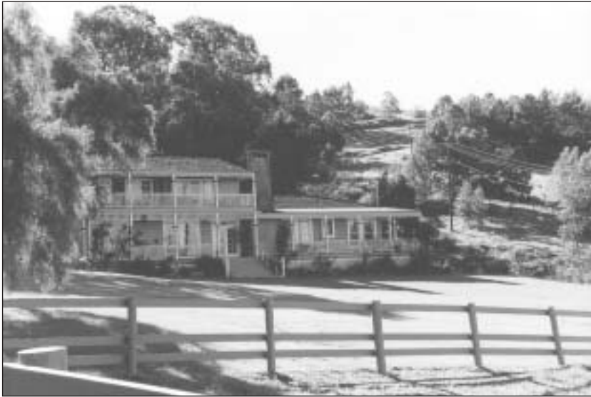
The Silver Cloud Ranch in Upcountry (Wallace)

While Maui is indeed beautiful and offers many experiences to the vacationer, with lots of hidden corners to explore and "get away from it all", it's no secret that it is fast becoming very developed, with large resorts, golf courses, etc., appearing along many of the coasts at an alarming rate. Not so its sister island Molokai. Molokai is an island apart and, as many people pointed