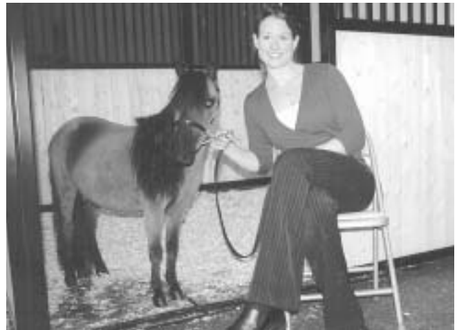
A miniature horse makes his debut at the Royal Winter Fair (Wallace)

● There's no better way to brighten November than with a visit to Toronto's Royal Agricultural Winter Fair, especially if you can take some children. It's all a delight, from serious livestock competitions and horse shows to monster pumpkins, miniature horses, petting zoos and fabulous canines. This year the event will take place from 4 - 13 November and tickets can be obtained by calling 416 872 7777 or on line at www.royalfair.org (or call 416 263 3400 for information).