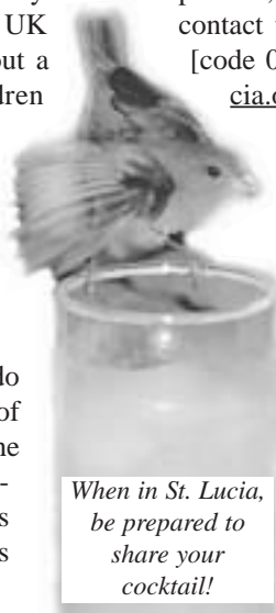
When in St. Lucia, be prepared to share your cocktail!

A relaxing day trip is the drive to Marigot Bay, home to stories of pirate ships and the British Navy as well as the location of such movies as Dr. Doolittle and Fire Power . A steep road leads down to the marina where you can look at the sailboats before catching a ride with a local (he'll charge about one US dollar) across