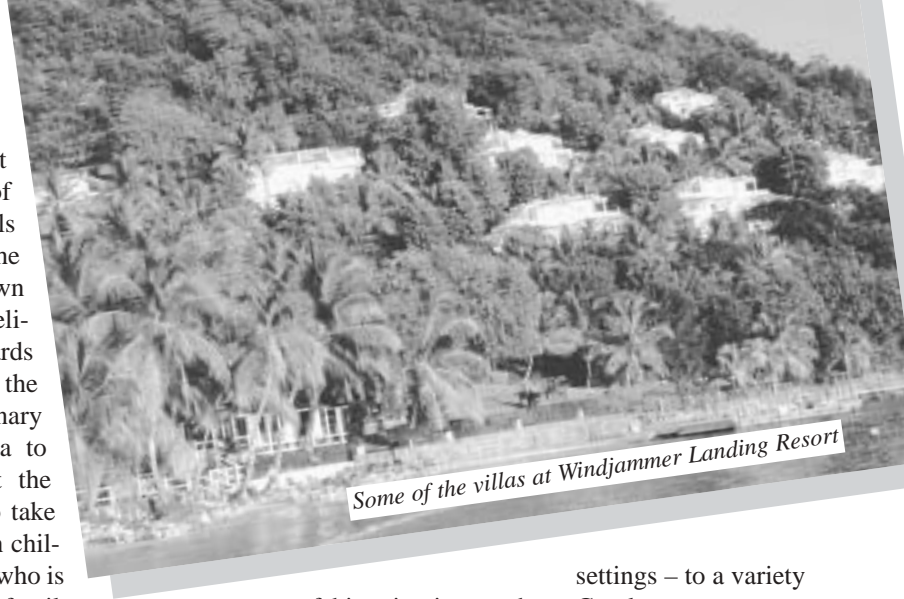
Some of the villas at Windjammer Landing Resort

So we move on to what there is to see and do on St. Lucia (and if you have back copies of TravelScoop you'll find more information in the December 1994 edition). There's a unique drive-in volcano and, of course, beaches and water sports galore. The Heritage Tourism Programme (details below) offers tours – many with lunches in unusual