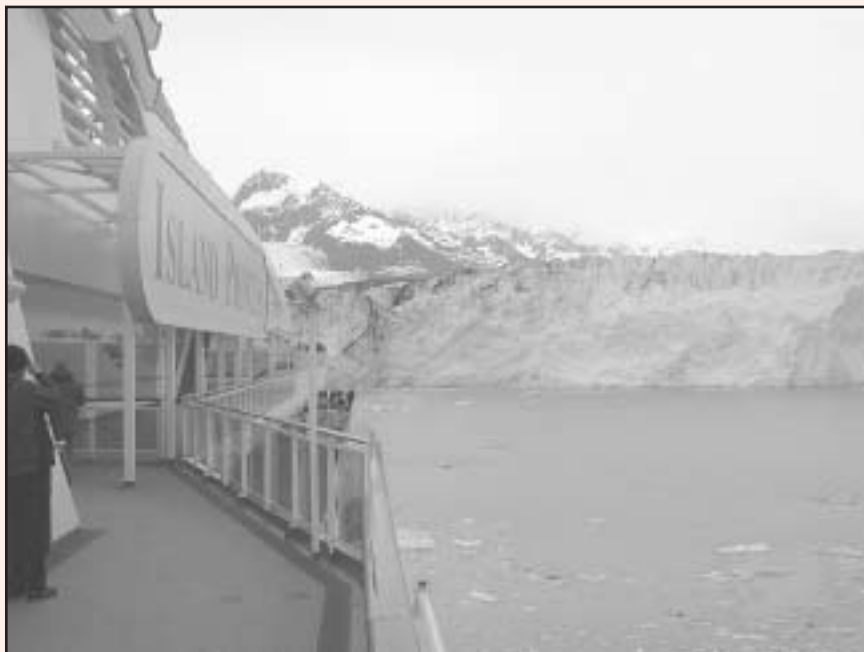
The Island Princess on the Alaska coast

S o you've decided to visit Alaska. Your next decision is how to go about it. Our choice was a one-way cruise aboard the Island Princess from Vancouver to Whittier, followed by a one-week land tour on our own. Before we give some details of our trip, we would like to state that