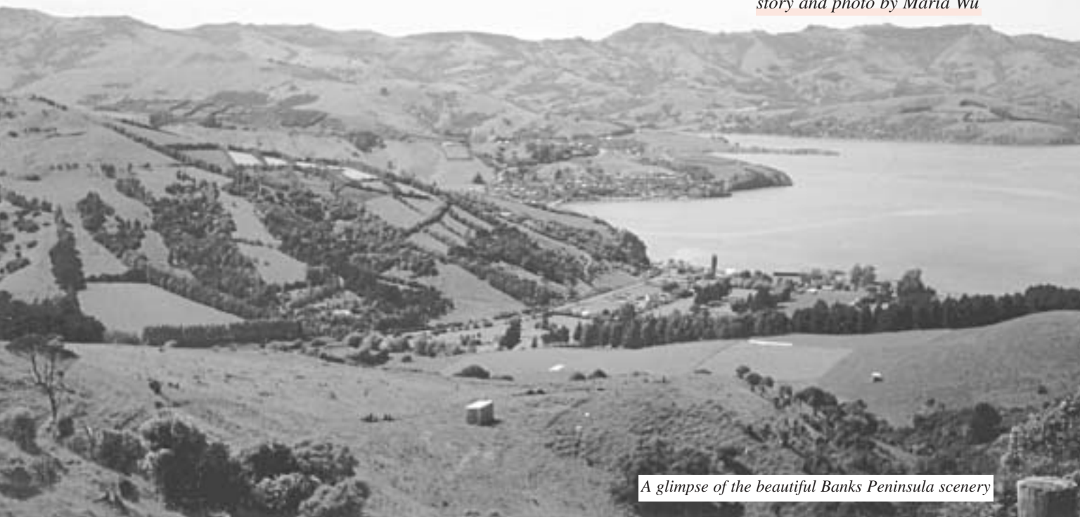
A glimpse of the beautiful Banks Peninsula scenery