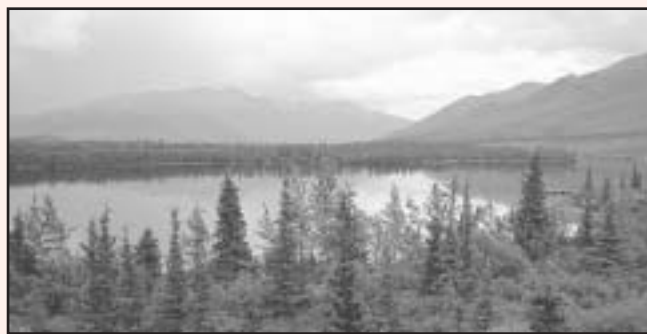
View from the Denali Lakeview Inn

If you would prefer to explore Alaska (and Yukon) by Bus, Car, Train and Ferry, we have that story coming soon! - Ed.