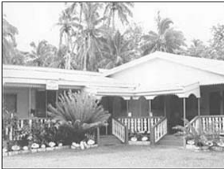
Lindsays Guest House, Lifuka Island