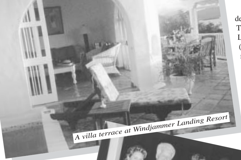
A villa terrace at Windjammer Landing Resort