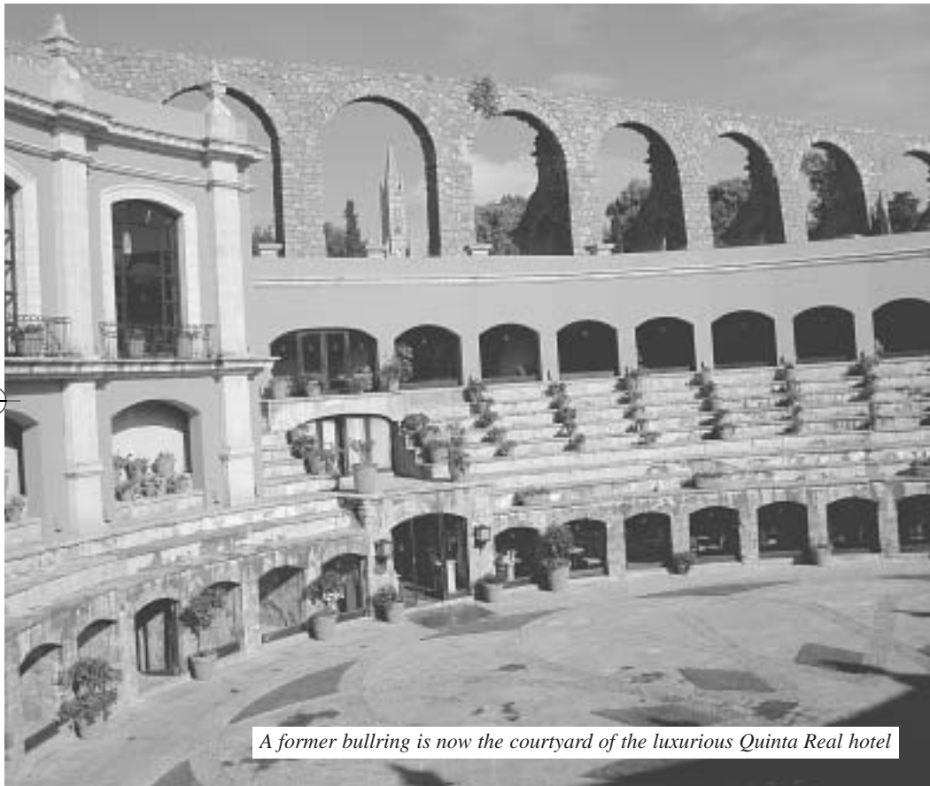
A former bullring is now the courtyard of the luxurious Quinta Real hotel

T his article is riddled with prejudice and personal opinions. But let me confess. I love Zacatecas . I think it's the most beautiful and hospitable city in Mexico. There! Now I feel better.