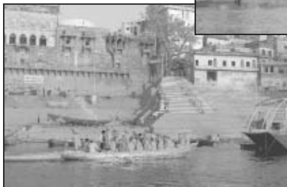
The Ghats at Varanasi