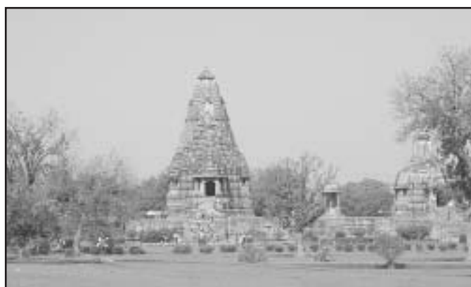
Temples at Khajuraho

For me the most surprising temple site was at Khajuraho. Until I saw the itinerary I was unaware of this World Heritage site but it turned out to be perhaps the loveliest place we visited (it is difficult to choose). The park-like setting of the Western Group is very beautiful and tranquil, again enhanced by the lack of hawkers and beggars, who