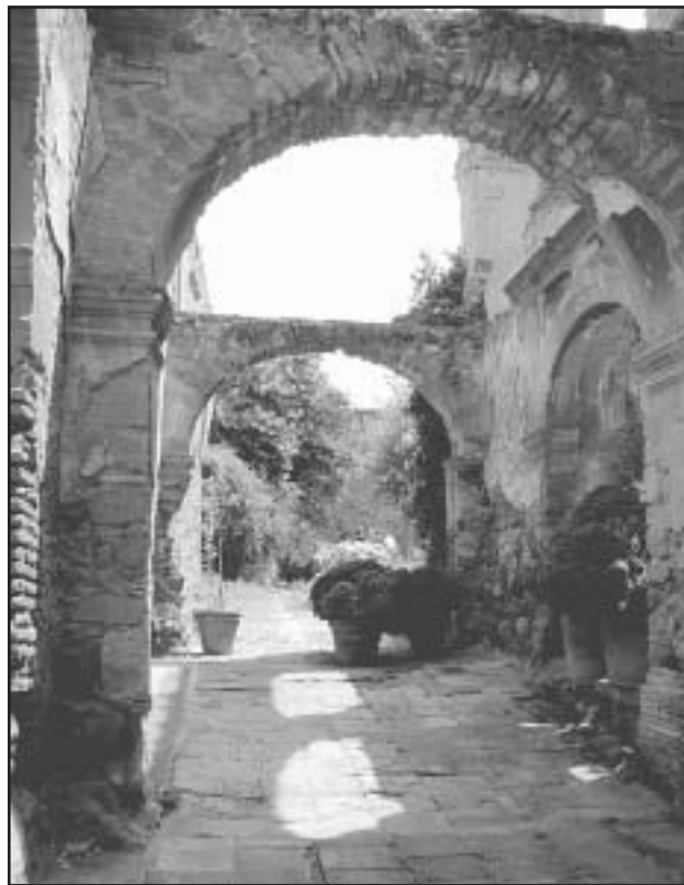
Ruins of an ancient monastery are part of the picturesque Pedro Coronado museum

But the war must go on. With whoops and cannon blasts, the Moors roar down into the plaza, forming up row upon row, their drums never ceasing. Then on a distant hill, the Christians emerge — thousands of them forming a human