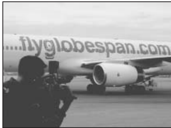
Photographers and journalists were on hand to welcome flyglobespan's first flight into Hamilton, ON

If you've long wanted to visit Jordan, the fact that Royal Jordanian commenced a twice-weekly non-stop from Montreal to Amman on 25 May may be welcome news.