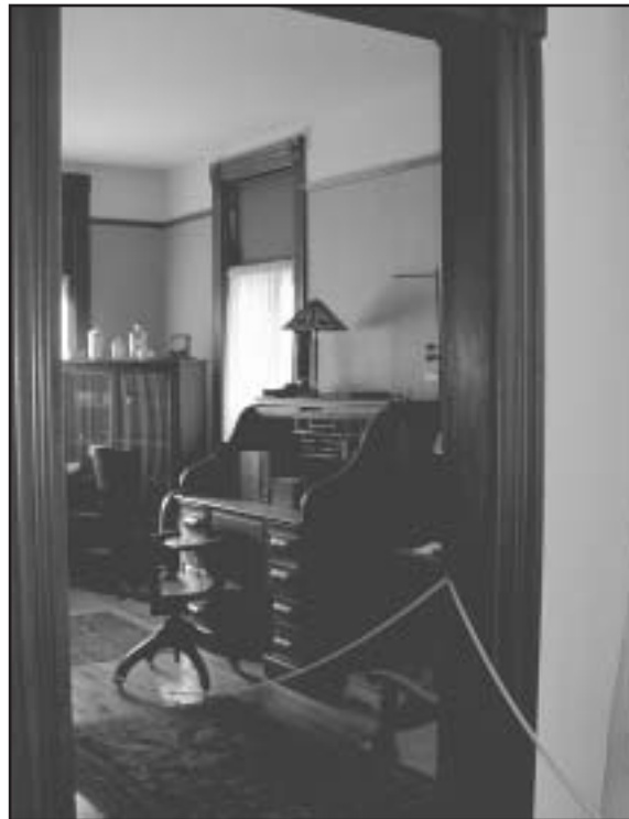
Visitors can imagine the good Dr. Banting working here

The countryside surrounding the Waterloo/St. Jacobs area is a delight to explore (as it is around London too) and it's fascinating to see the Mennonite families travelling to market and back in their horse-drawn buggies. One can't help reflecting, as technology makes our world increasingly complex and stressful and our descendants face a world without oil, whether we shouldn't be learning more from these gentle people about self-sufficiency and resourcefulness in this fast-changing world. At the Visitor Centre in St. Jacobs one can learn more about Mennonite history, faith