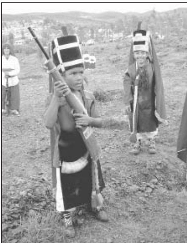
It's all child's play for youngsters who get into the act with guns and costumes

President Felipe Calderon waded in recently, suggesting that American money might be better spent on job-generating ventures in Mexico rather than the 850 km border fence that George Bush approved to discourage migrants. Mr. Calderone wants the U.S. to create a temporary worker programme that will decriminalize illegals now in the U.S. and allow them to cross the border freely. We shall see.