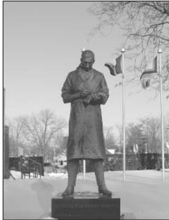
Sir Frederick Banting's statue outside his home

The various rooms in the house depict different aspects of Banting's life, from student to doctor to decorated war hero. There are also inspiring posters and stories on famous Canadians with diabetes. And then there's Banting the artist,