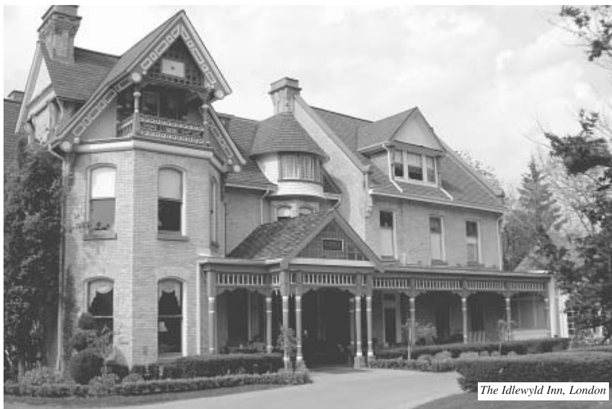
The Idlewyld Inn, London

T he Thames River flows through it; it's home to a park named after Queen Victoria and streets with names like Oxford, Blackfriars and Piccadilly; it boasts a market called Covent Garden; red double-decker buses take tourists around on summer days. Of course, the city's name is London. London, Ontario, that is. A fact that must be made clear when talking about a visit there.