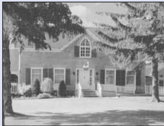
The Waring House Inn, near Picton, Prince Edward County, Ontario

Two of my personal favourite inns are located in Prince Edward County. This lovely area, full of farms, vineyards and pretty villages is almost an island. It’s