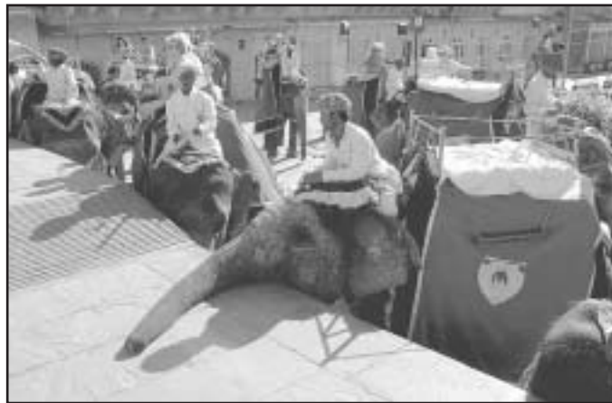
Elephants at Amber Fort